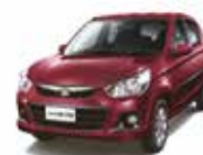
Fire Brick Red*